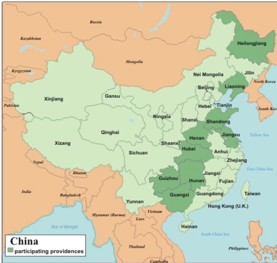
Figure 2: Participating Chinese provinces in survey